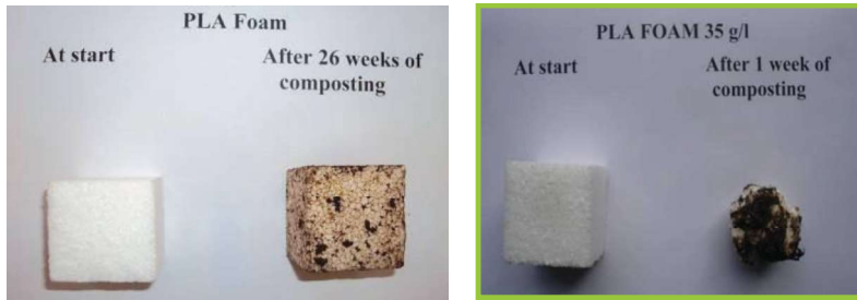
At room temperature (no degradation) at 70oC

Composta Block at 35 g/l does not disintegrate after 26 weeks of composting at room temperature at 20oC. Composta Block is therefore not home compostable as proven by tests carried out by Organic waste Systems (OWS) Gent finished March 2010. Test was terminated according to the norm without visible alteration.