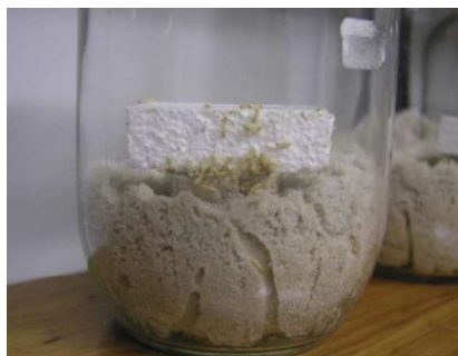
Photo of termites.

Termite test All Termites died after a formal 6 weeks test, there are minor traces of attack but all termites died probably due to lack of nutrients. Conclusion was that Composta Block is not sensitive to attack by termites conform the standard EN 117/118