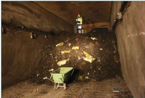
FBR Report 1561 - Final - April 2015 - Composting trial.pdf

An industrial composting trail with plant roots intergrown in Composta Block-C was carried out by Attero in Venlo, the Netherlands